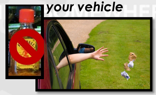
PLEASE PAY FULL ATTENTION:

Remain sober while traveling. Don't throw any debris from