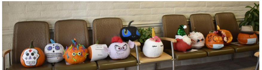
Halloween Pumpkin Decorating contest