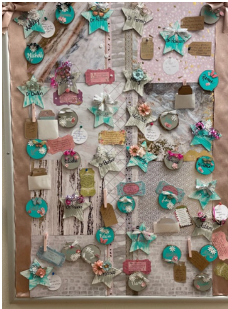
November Gratitude Wall